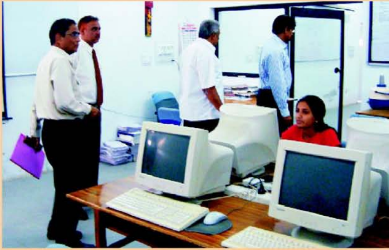
U.G.C. XI Plan team visit to the University Department