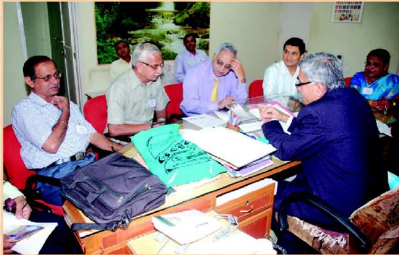
NAAC Peer Team members on visit to the University.