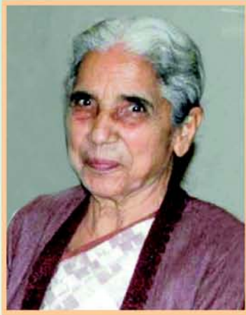
Dr. Shrimati Kamla H.E. the Governor of Gujarat