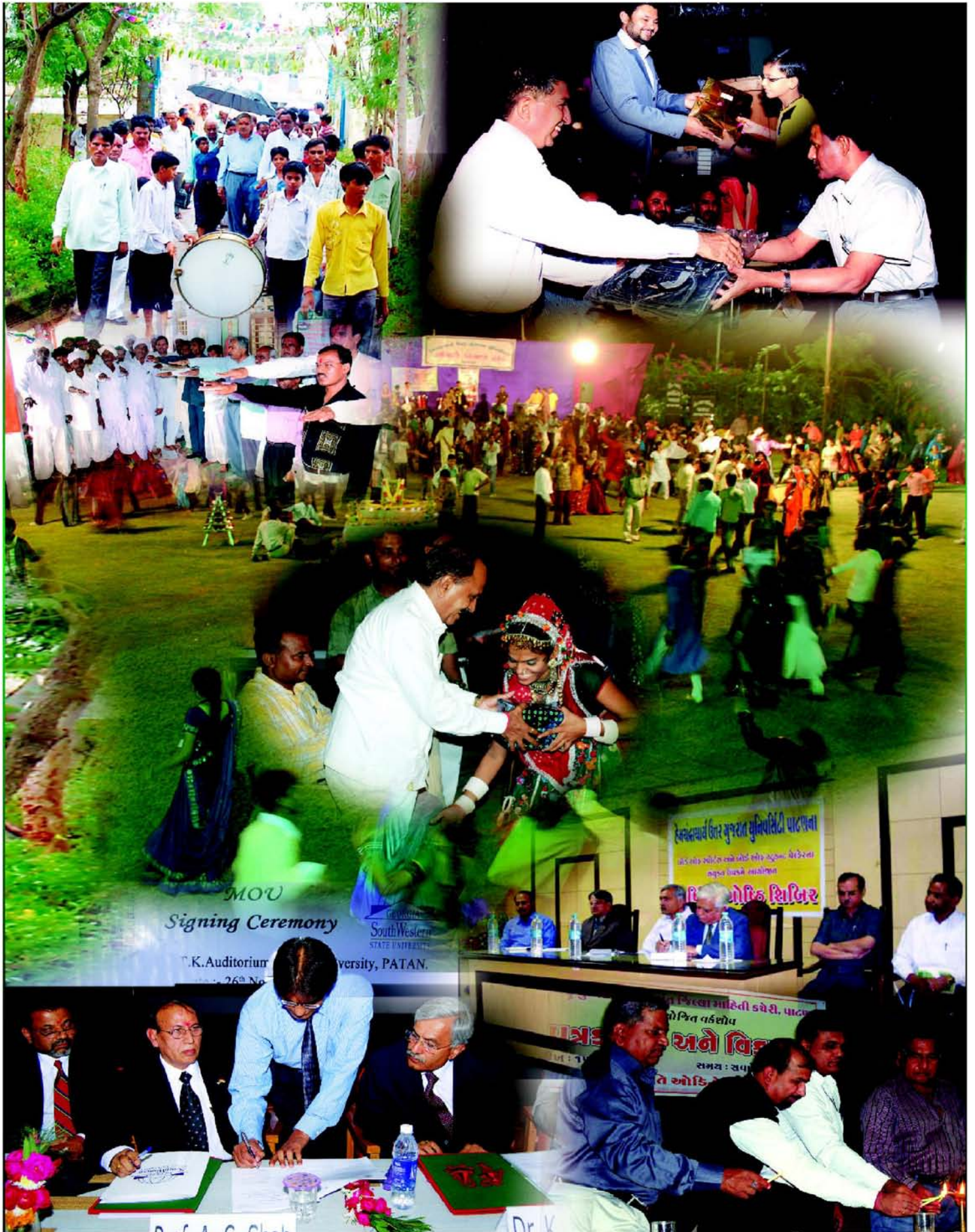
MOU Signing Ceremony