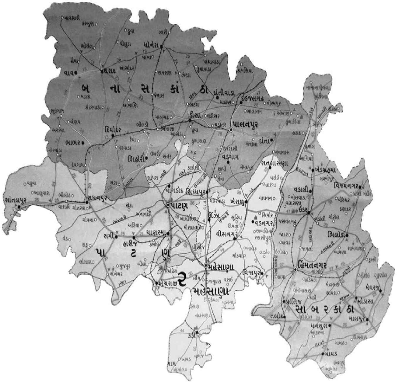
Jurisdiction of the University