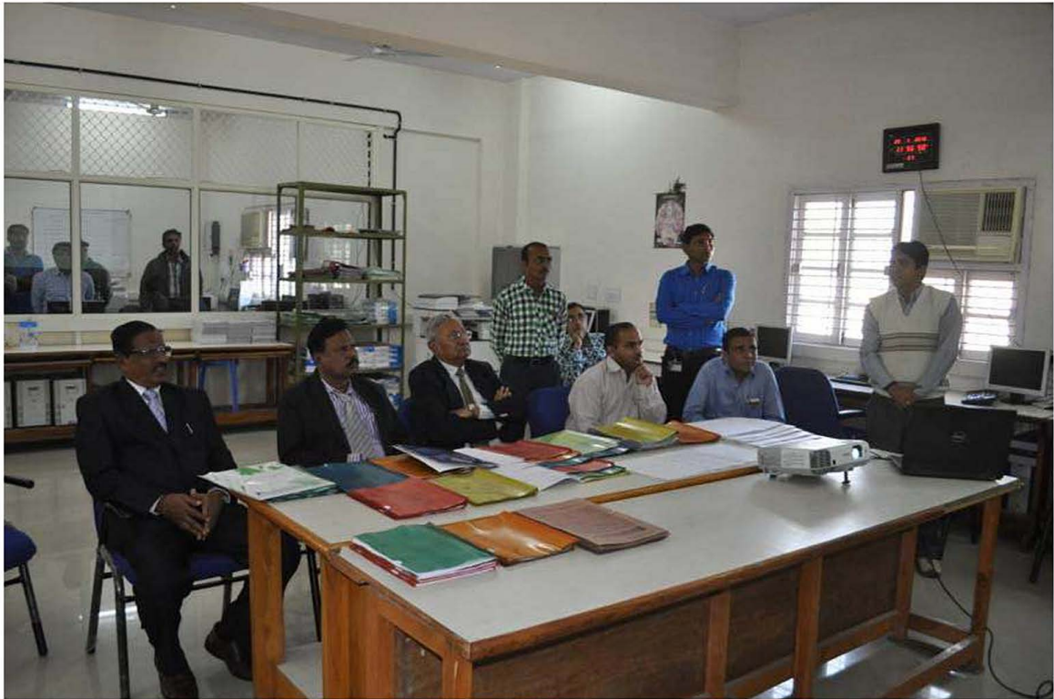
Meeting with the Registrar