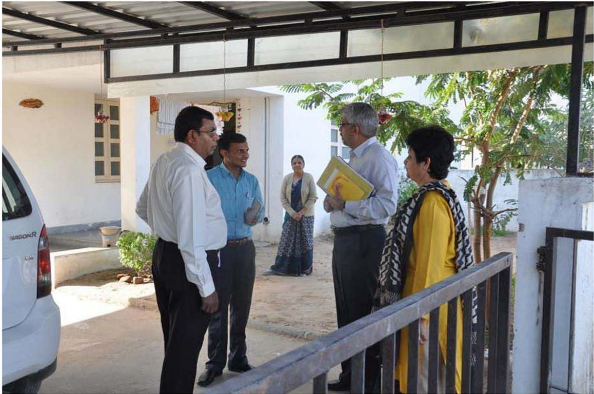
Visit to University Convention Center